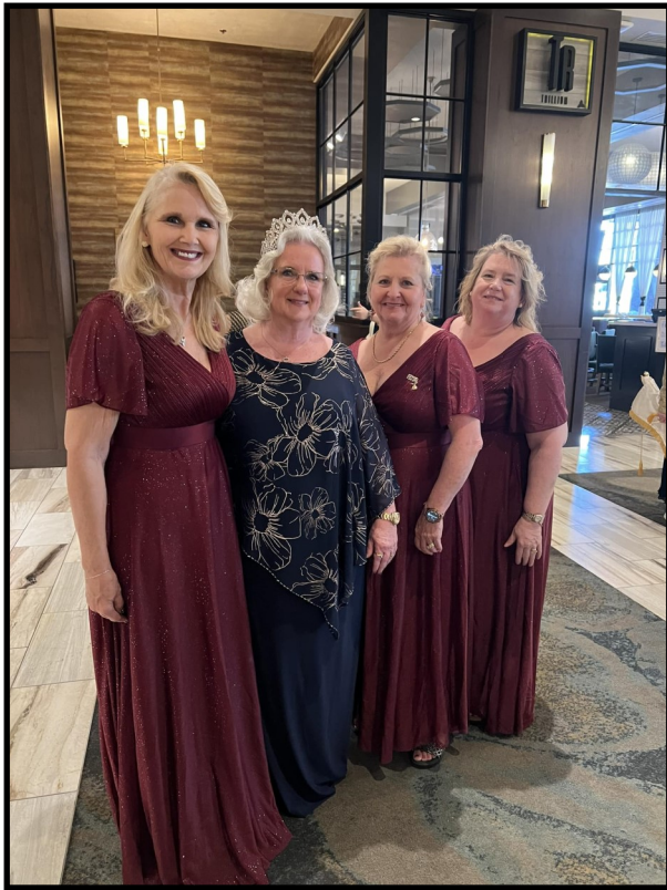
2024/25 Line Officers - Installation night—Supreme Session—Boise, ID