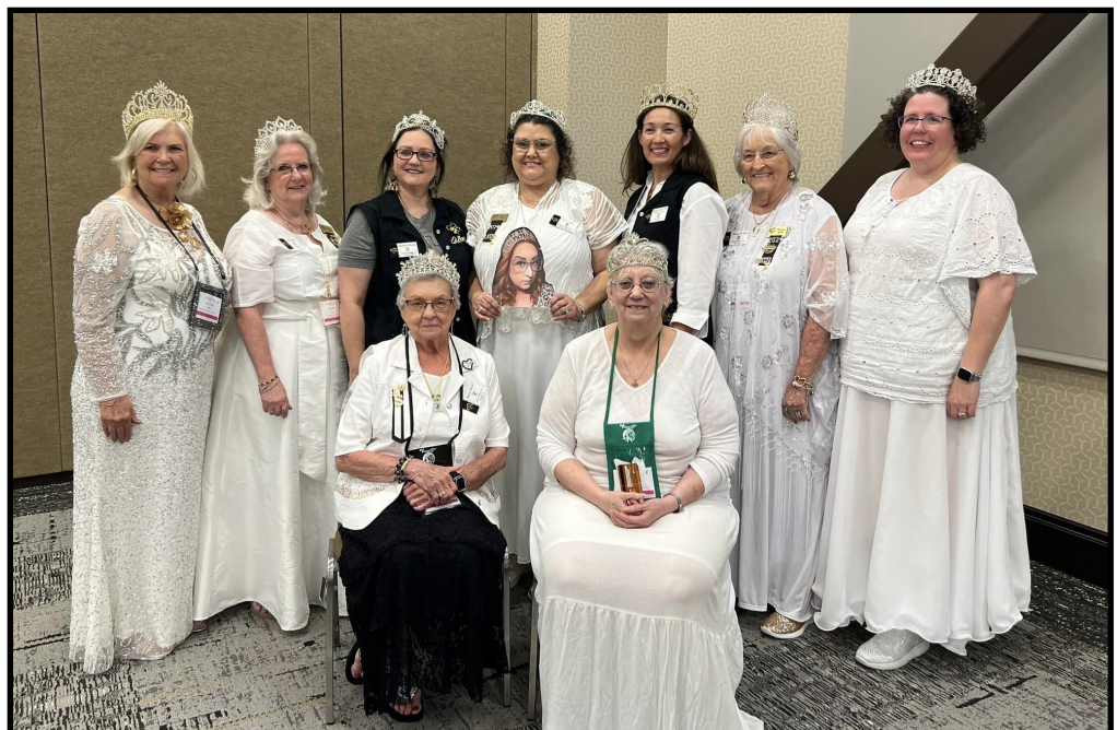
2024/25 Texas Queens—Texas Luncheon—Supreme Session—Boise, ID