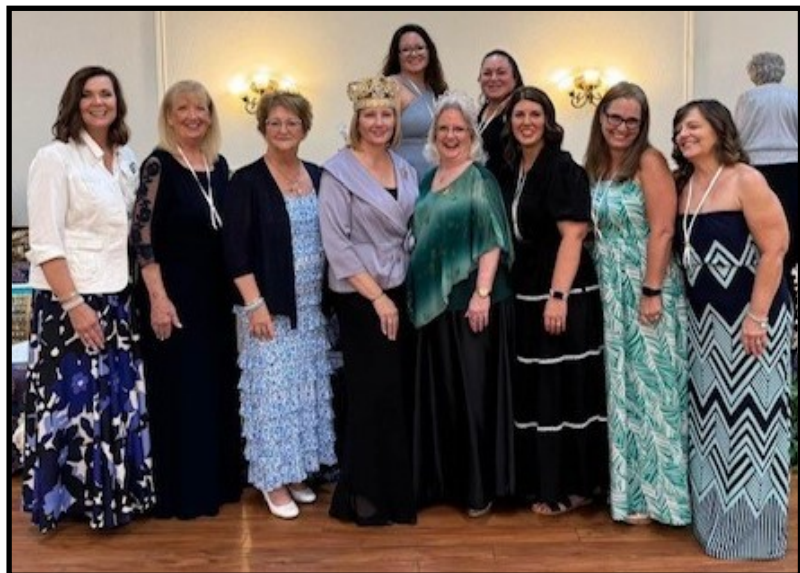
2024 Supreme Queen Official Visit New Princesses!