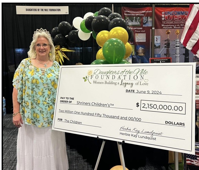
Queen Sheila—Imperial Session—Reno, NV